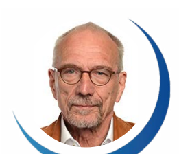
Nils TORVALDS Vice-Chair for Baltic Sea