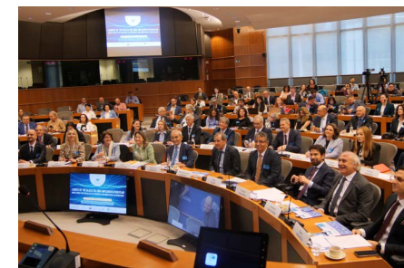
Launch of the Black Sea SRIA Implementation Plan, hosted by MEP Marian-Jean Marinescu, 4 May 2023

In May 2023, the Final SRIA Implementation Plan has been launched during a SEARICA event hosted by MEP Marian-Jean Marinescu . This guide aims to support the preservation of the Black Sea's distinctive habitats, foster sea-based sector growth, and stimulate employment through collaborative efforts across academia, funding bodies, industry, policy makers, and civil society.