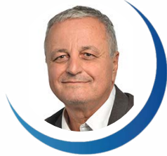
Francois ALFONSI Vice-Chair for Islands