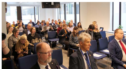
SEArice event; The Baltic Sea Region – a key Region for European energy resilience in a challenging geopolitical context, 2 february 2023

Erik Bergkvist. In 2022, MEP Erik Bergkvist kicked-off the activities by hosting a political discussion on the potential and challenges for the green transition and blue economy in the Arctic, and on means to increase interregional cooperation to maintain a peaceful Arctic. In this respect, the SEArice Intergroup allowed to enlarge the reflection on the future of the area beyond the sectoral approach, with specific attention to Arctic coastal communities' needs and priorities.