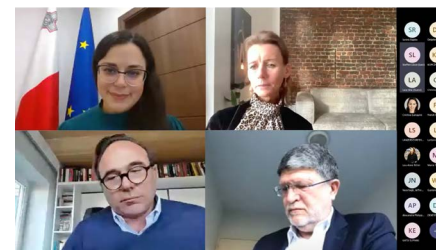
SEArca event: Towards a maritime sector fit for 55, 7 december 2021 with the participation of (from left to right) MEP Josianne Cutajar, SEArca member Caroline Nagtegaal, MEP Petros Kokkalis and SEArca Chair MEP Tonino Picula

MEP Petros Kokkalis , MEP Rasmus Andresen (ITRE FuelEU Rapporteur) and MEP Caroline Nagtegaal (TRAN shadow rapporteur for AFIR) have addressed the path to decarbonisation of maritime transports through the EU legislative context. A follow-up session, addressing FuelEU, the Social Climate Fund and ReFuelEU Aviation has been organised in the next months also in the presence of MEP Claudia Monteiro de Aguiar , MEP Jan-Christoph Oetjen and MEP Catherine Chabaud , as well as thematical events to explore measures to help the shipping industry to reduce its emissions.