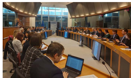
SEArca event on Mission Clean Oceans, 17 february 2020