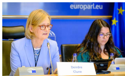
MEP Deirdre Clune at the SEArice event; ports as hubs of the blue economy, 27 June 2023

Inspired by the SEArice exchanges on marine litter, MEP Catherine Chabaud called for the continuation of the CleanAtlantic project in her INI Report “Impact on Fisheries Marine Litter”, adopted in March 2021. Today, the partnership has successfully renewed their collaboration through the approval of the FreeLitterAt project that will address the prevention and reduction of macro and micro litter in the Atlantic until 2026.