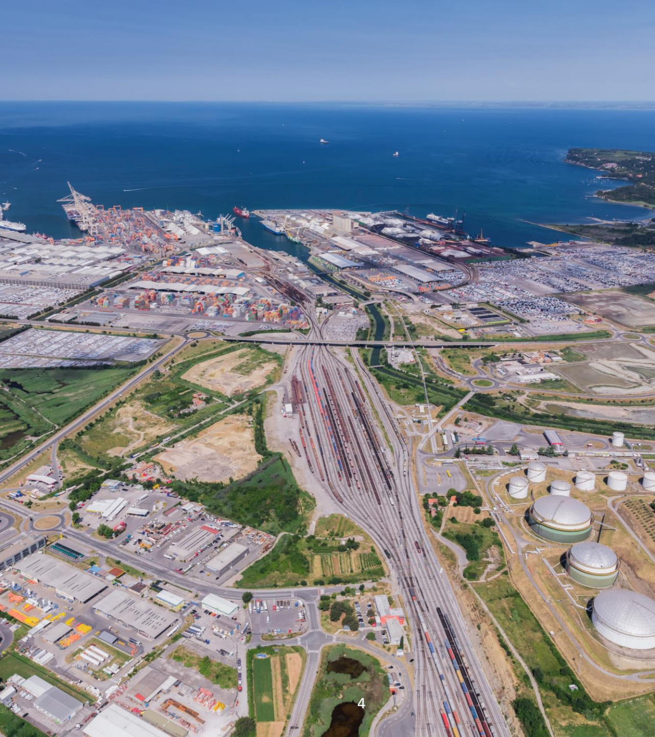
Public and private Rail Infrastructure within the Port of Hamburg