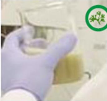
Biostimulants from Seaweed, Algaia