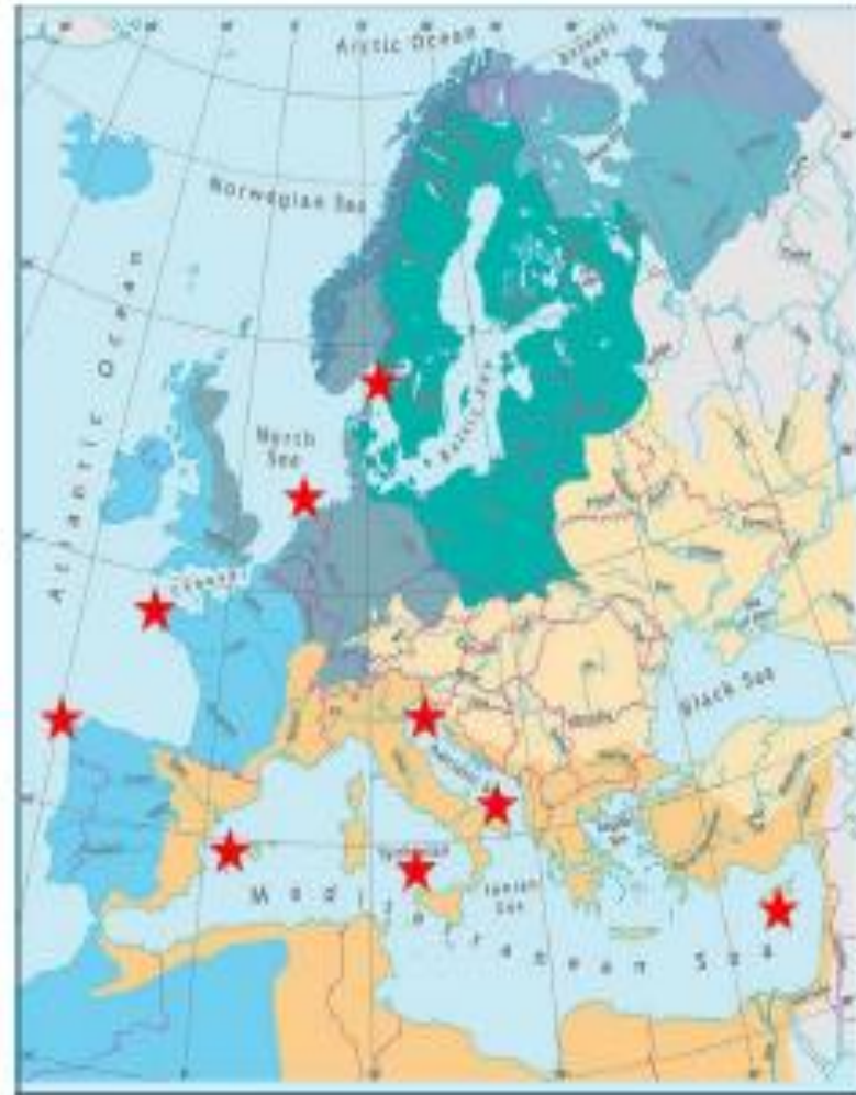
Figure 2. Location of case studies within European regional seas