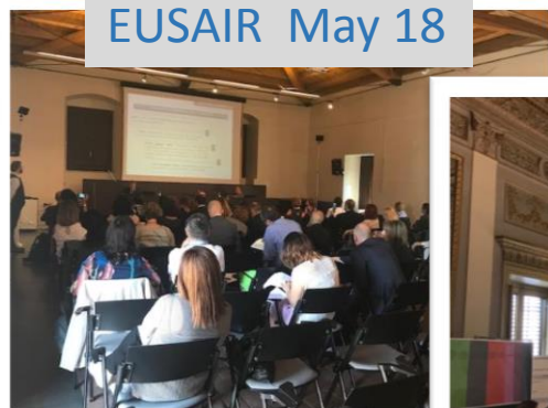
EUSAIR May 18