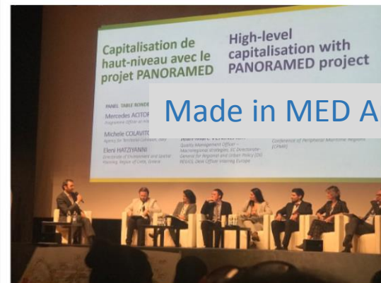
Made in MED April 18