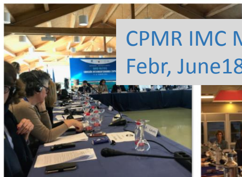
CPMR IMC Meetings, PB,GA Febr, June18