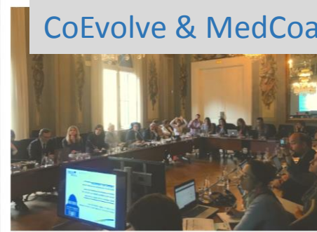
CoEvolve & MedCoast4BG Oct18