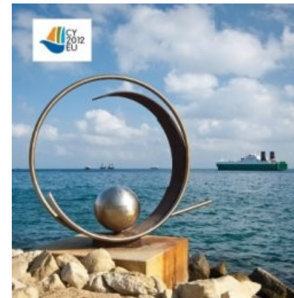
The Blue Growth agenda was adopted in the Limassol declaration in 2012 under the Cypriot presidency