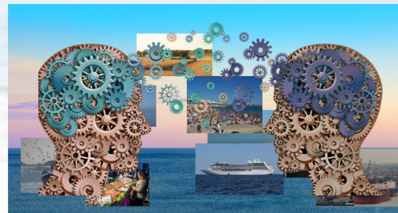
Ocean Knowledge System

The role of Responsible Research & Innovation and Ocean Literacy