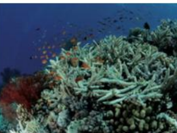
"A united ocean action for a global climate agenda"

Ocean-based solutions for climate mitigation and adaptation measures