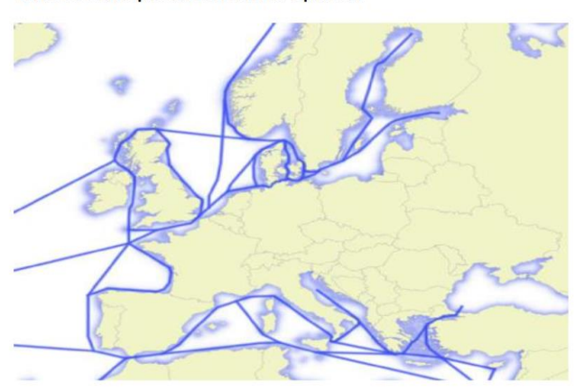
This is Europe's maritime space!

Since their creation in 2001, the Commission has always had difficulty in mapping the MoS. The map below, taken from the DIP1, shows that the issue has still not been resolved 15 years later.